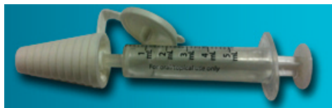
Syringe with bottle adapter on

EZY DOSE oral syringe with cork-style bottle adapter.